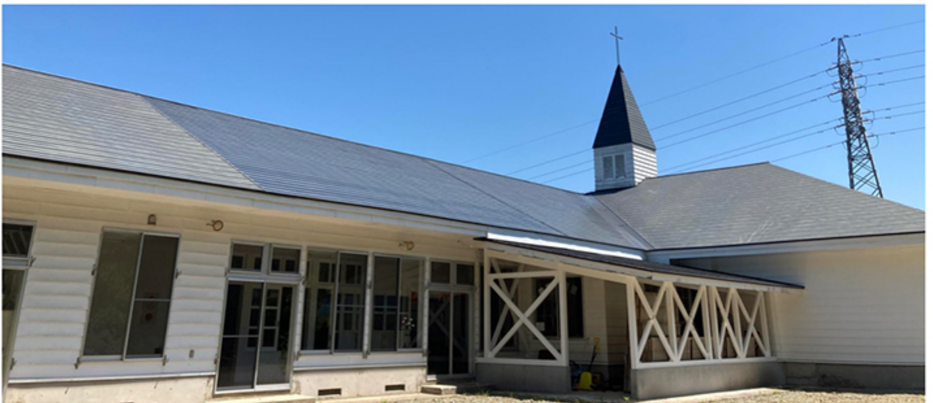
During the repair of the roof and ceiling at Shinjo Catholic Church and the results