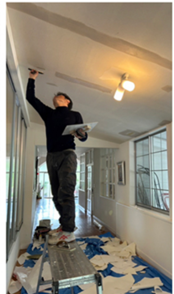
Photos during the repairs of the church's roof and ceiling