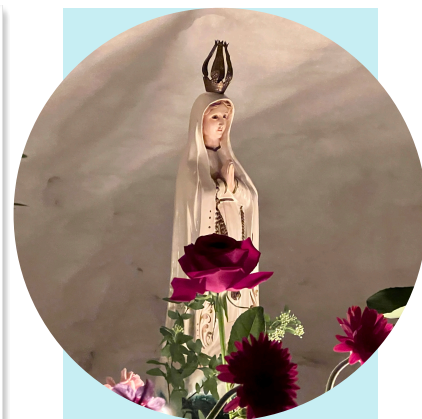
Lady of the Snow