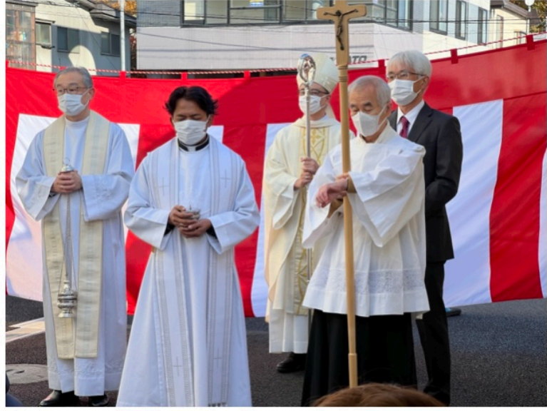
Before the thanksgiving mass