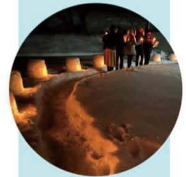
The evening lit up as congregants walk up to the grotto of Our Lady