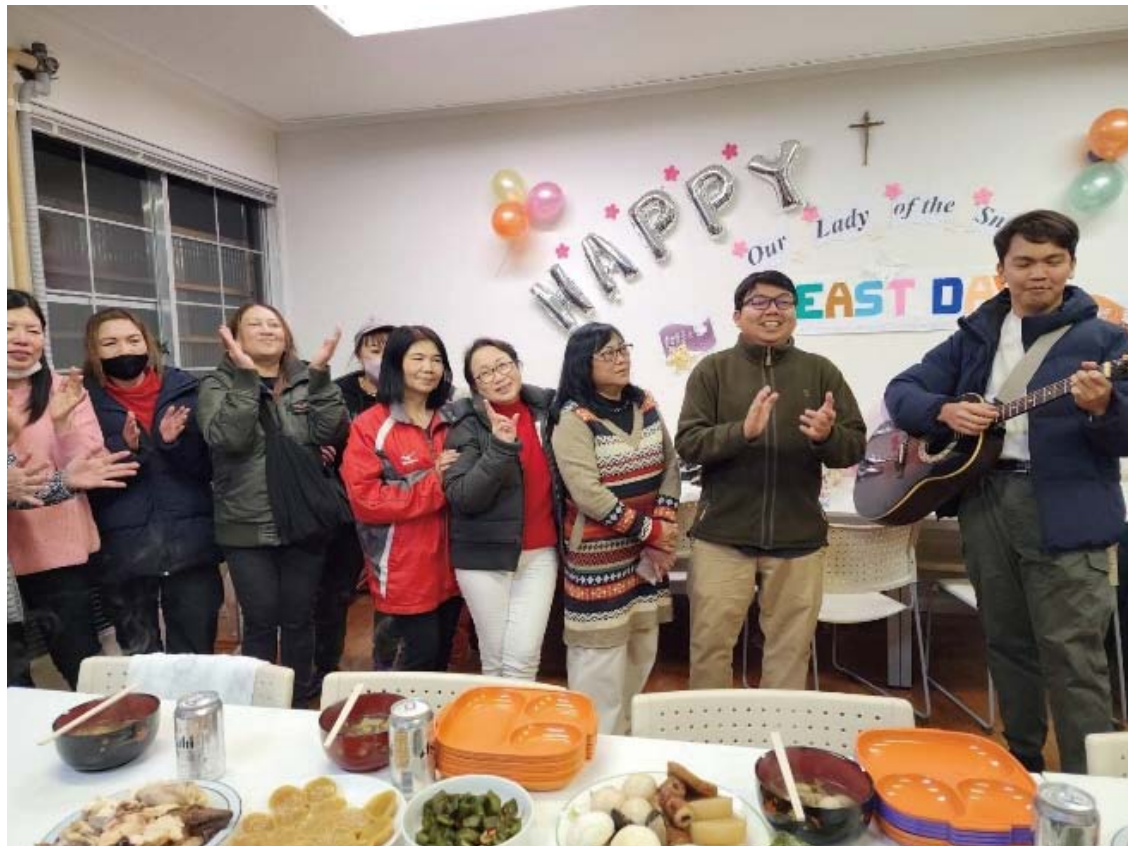
February Birthday Celebrant