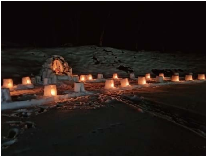
Beautiful Night Scenery 綺麗な夜の風景