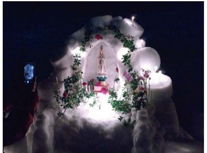
Our Lady of Snow 雪の聖母