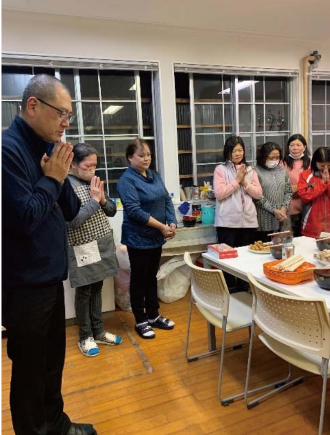
Prayer before the mini party