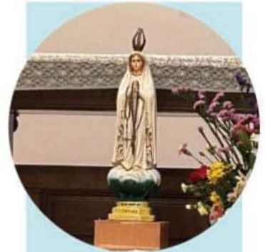
Our Lady of Snows